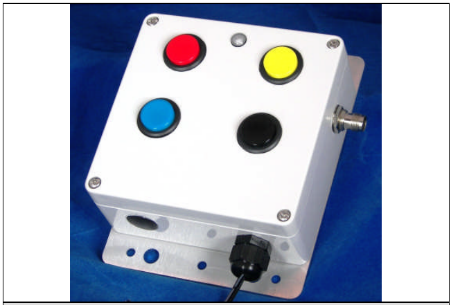
Note – Model 36-1400-4B Pictured Dimensions (with mounting plate) 6.3" L x 4.8" W x 2.3" H