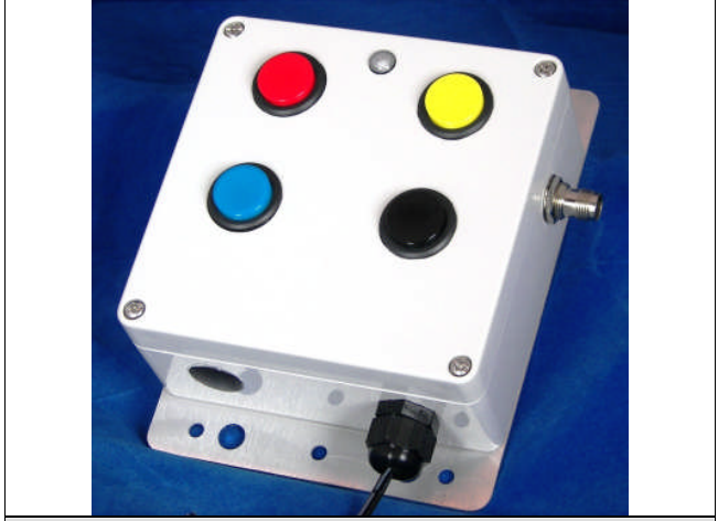
Dimensions (with mounting plate) 6.3" L x 4.8" W x 2.3" H