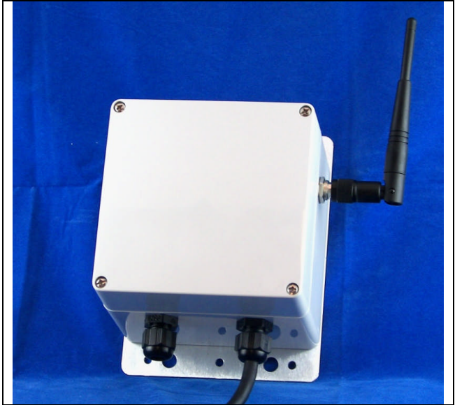
Dimensions (with mounting plate) 6.3" L x 4.8" W x 4.3" H