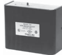
Series 750 Control Unit