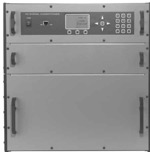
Controller with Model A2-EC Expansion Cabinet

115 or 230 VAC with optional external "line lump" power supply (15 VDC output). Will also work from a 12V battery with reduced specifications.