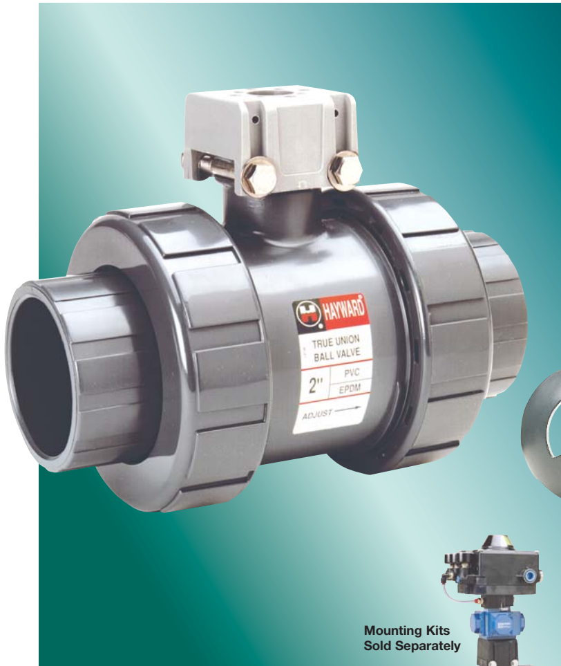
Mounting Kits Sold Separately