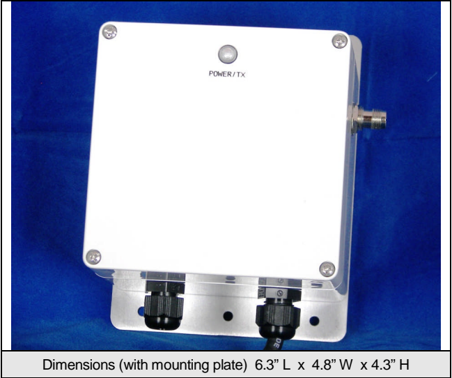
Dimensions (with mounting plate) 6.3" L x 4.8" W x 4.3" H