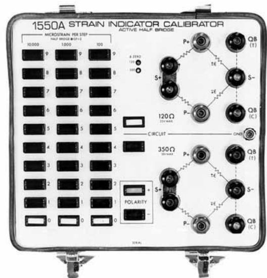
A certificate of calibration is provided with each Model 1550A Calibrator

All specifications are nominal or typical at +23°C unless noted.