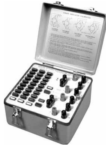
A laboratory standard for verifying the calibration of strain and transducer indicators.