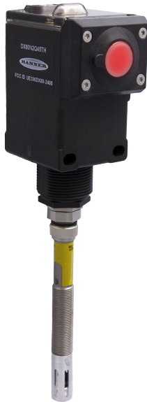
(Shown with the temperature/humidity sensor connected)

SureCross® Wireless Q45 Sensors combine the best of Banner's flexible Q45 sensor family with its reliable, field-proven, SureCross wireless architecture to solve new classes of applications limited only by the user's imagination. Containing a variety of sensor models, a radio, and internal battery supply, this product line is truly plug and play.